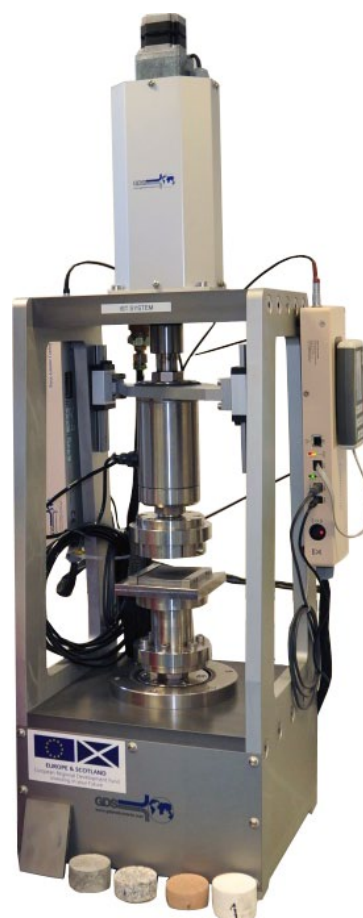
Figure 2. Interface Shear Tester

“Dealing with GDS during specification and supply of the equipment was a very pleasant experience with GDS happy to incorporate the bespoke demands of our application. It is always re-assuring to deal with people that fully understand the capabilities and function of equipment they have designed. This makes it easy to assess the capabilities of a device and understand what modification to standard equipment can easily be accommodated. Operation of the equipment is straight forward and easy for somebody familiar with GDSLAB. During testing we are finding the equipment is more versatile than we first anticipated and are able to use it for work outside of our original equipment needs. GDS will be our first port of call for any future lab equipment.”