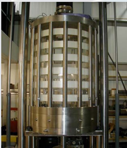
300mm Triaxial Cell with HKUST at Nottingham University - NCG

Standard methods of volume change measurement using back pressure volume change or local measurement may not be applicable for some samples due to the dry or semi-saturated nature of some triaxial testing associated with transportation Geotechnics. Local strain measurement techniques tend to measure the grain movements rather than the overall dimension change of the sample for samples with very large grain sizes. This has led to a new application of the HKUST total volume change measurement system being implemented for large samples.