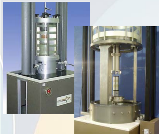
Hollow Cylinder Apparatus - Standard and Large Diameter

PSR had been studied in track foundations by use of a combination of the Hollow Cylinder Apparatus and, shown below left and dynamic finite element analysis. Similar versions of the Hollow Cylinder Apparatus have since been developed to test samples with diameters of up to 200mm, below right .