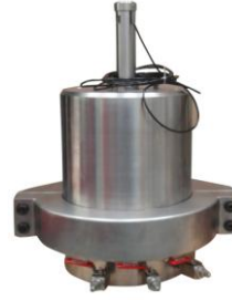
Fig. 7, 14MPa Triaxial Cell with 80mm sample height