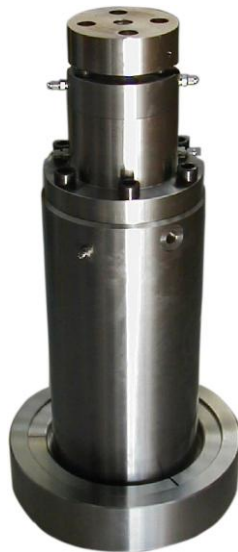
Fig. 4, 64MPa Triaxial Cell with balanced ram (HP64CL)

The balanced ram is a system that compensates for the up thrust on the ram exerted by the cell pressure. Our system utilises a secondary chamber around the ram that balances the pressure in the cell against a second piston seal such that the pressure load is not exerted onto the loadframe. This system usually means that a smaller range loadframe can be used to achieve the same deviator loadings on the sample. For example if a cell has a 50mm diameter ram and a cell pressure of 32MPa the up thrust would be approximately 63kN on the frame. This would have to be deducted from the maximum achievable deviator loading that a given frame can apply. With a balanced ram, the full load frame capacity may be used to apply axial force on the sample as there is zero ram upthrust. In addition, a balanced ram within a high pressure passive cell eliminates disturbance to constant cell pressure during axial loading.