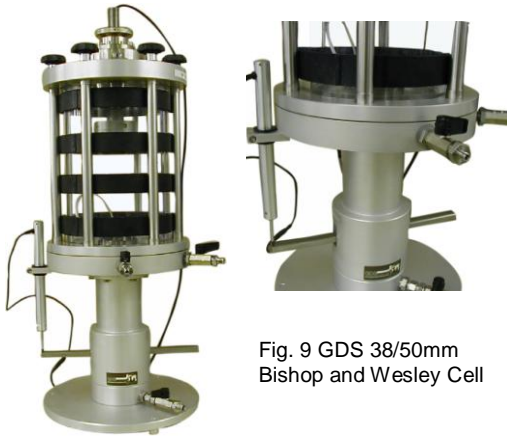
Fig. 9 GDS 38/50mm Bishop and Wesley Cell