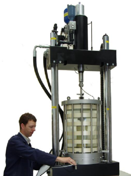
Fig. 3, 500mm Triaxial Cell