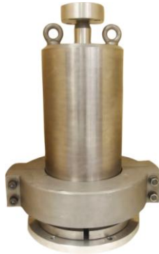
Fig. 6, 100MPa Triaxial Cell