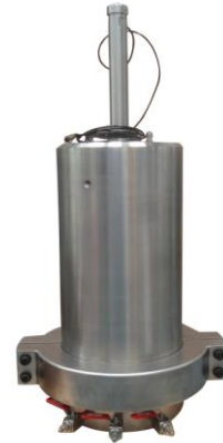
Fig. 8, 14MPa Triaxial Cell with 300mm sample height