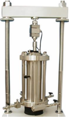
Fig. 5, 14MPa Passive Triaxial Cell

For triaxial cells that do not have balanced rams, accommodation needs to be made for the potential maximum ram upthrust (in particular high pressure triaxial cells). The load frame that the cell is being used in must be capable of taking the maximum ram upthrust. If this is not the case, a balanced ram solution can be considered. Porting is provided for local instrumentation.