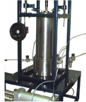
Fig. 10 GDS 10MPa Bishop and Wesley Cell