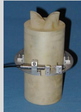
Fig 2: Radial local strain transducers mounted directly on a triaxial test specimen

The LVDT is positioned across the opening of the caliper where it measures the opening and closing of the jaws. Both the axial and radial devices are designed so that self-weight is partly counteracted by buoyant uplift.