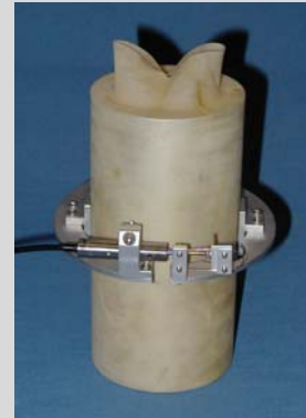
Fig 2: Radial local strain transducers mounted directly on a triaxial test specimen

The LVDT is positioned across the opening of the caliper where it measures the opening and closing of the jaws. Both the axial and radial devices are designed so that self-weight is partly counteracted by buoyant uplift.