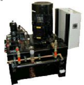
Fig. 2 GDS 25MPa hydraulic power unit

Pressure for the system is provided by a separate hydraulic power unit, which provides a constant source of pressure at 25MPa (see Fig. 2). This pressure source is used by the axial and radial actuators to control pressure and displacement. It is also used to raise and lower the top beam (in high pressure only). Noise specifications of power pack, <75 dB(A) at >5m, and <90 dB(A) at >1m.