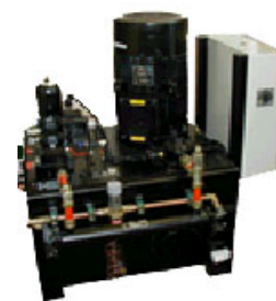
Fig. 2 GDS 25MPa hydraulic power unit

Pressure for the system is provided by a separate hydraulic power unit, which provides a constant source of pressure at 25MPa (see Fig. 2). This pressure source is used by the axial and radial actuators to control pressure and displacement. It is also used to raise and lower the top beam (in high pressure only).