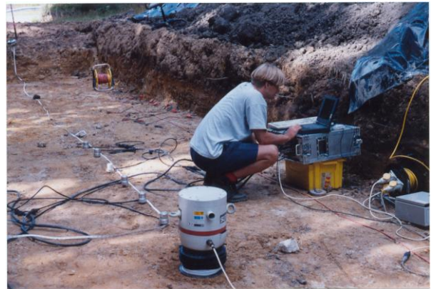
Fig 3. Photograph showing a six-geophone layout on one of our test sites