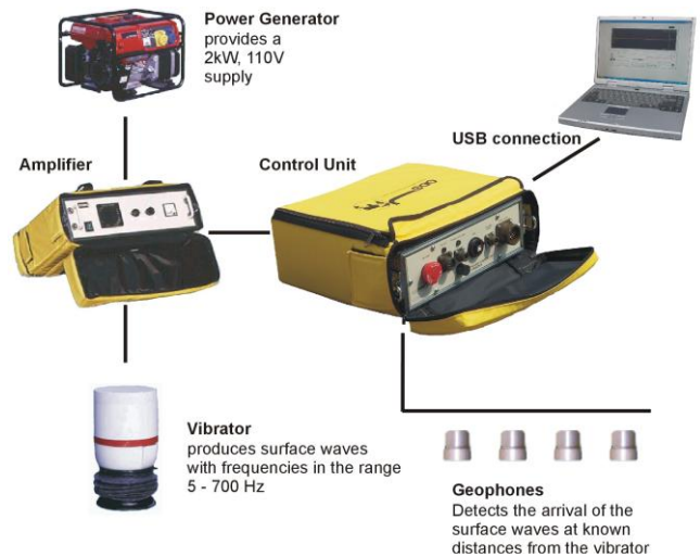
Fig 4. Principal Components of CSWS