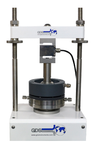
Fig 3. Open-topped CRS